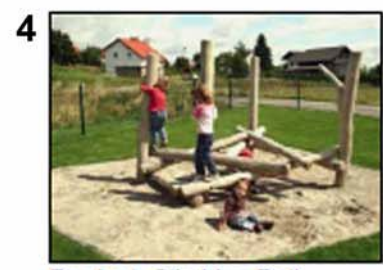
4 Product: Climbing Path Supplier: Russell Play Product Code: H13_1