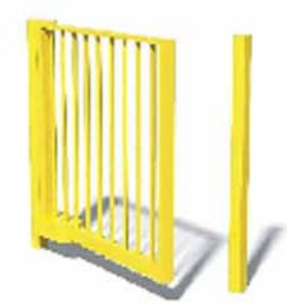
Self closing Wicksteed Gate