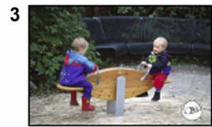
3 Product: Small Sea Saw Supplier: Timber Play Product Code: 611700