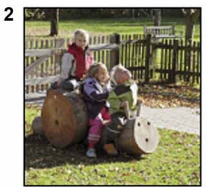
2 Product: Large Snail Supplier: Richter Spielgerate GMBH Product Code: 4.24230