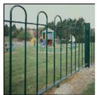
Green Bow Top Fencing to enclose play area 1.2m high