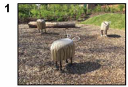
1 Product: Sheep Supplier: Richter Spielgerate GMBH Product Code: 4.24270

KEY: Supplier: Terram Product: Safety rubber matting 1x1.5m Thickness: 22mm Openings 250mm