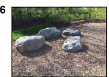
6 Product: Boulders Supplier: Russell Play Product Code: TC1003