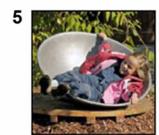
5 Product: Wobble Dish Supplier: Richter Spielgerate GMBH Product Code: 6.27300