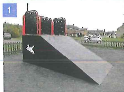
Caloo Handrail Box