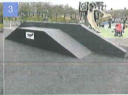
Caloo Quarter Pipe