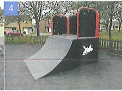
Caloo Spine Ramp