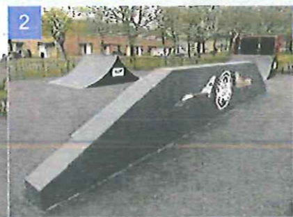
Caloo Fun Box