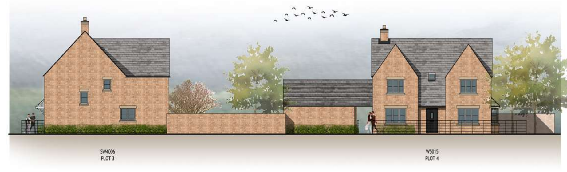
STREET SCENE D-D' Plots 3-4 Scale: 1:200