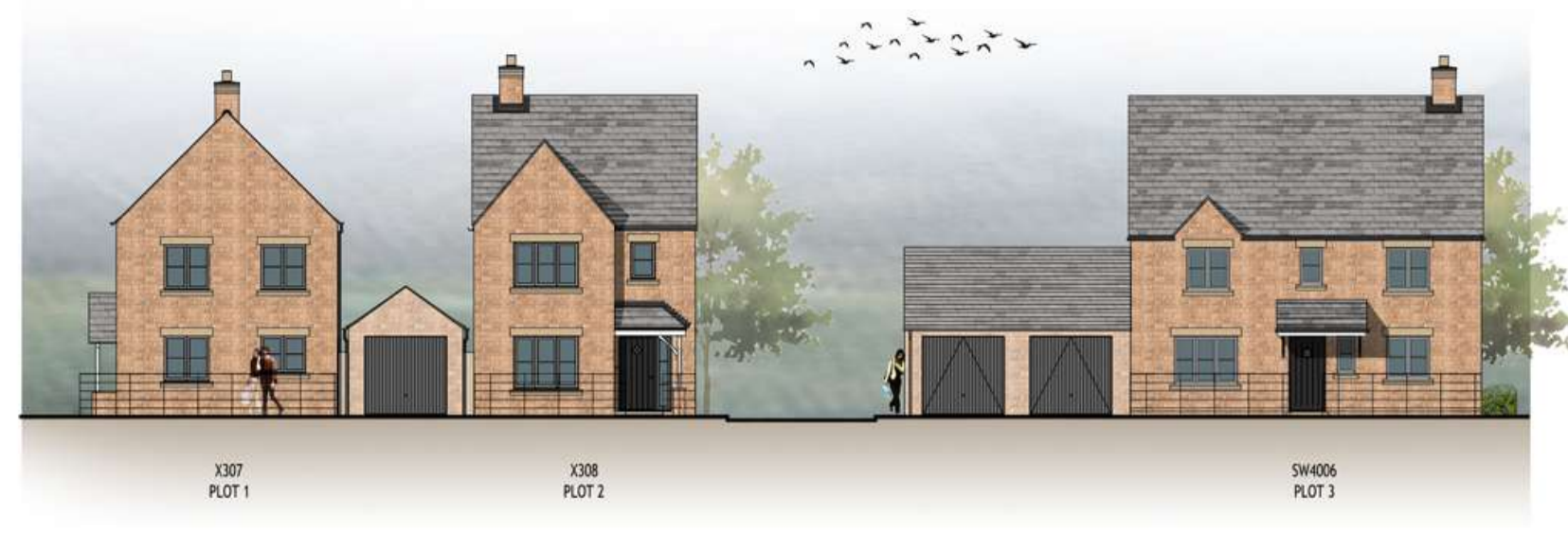
STREET SCENE A-A' Plots 1-3 Scale: 1:200

BM Transmittal Disclaimer McBains Ltd makes no express or implied warranties with respect to the character, function, or capabilities of the data (inclusive of 3rd party data incorporated within), or the suitability of the data for any particular purpose beyond those originally intended by McBains Ltd. Please refer to our standard terms and conditions for further details.