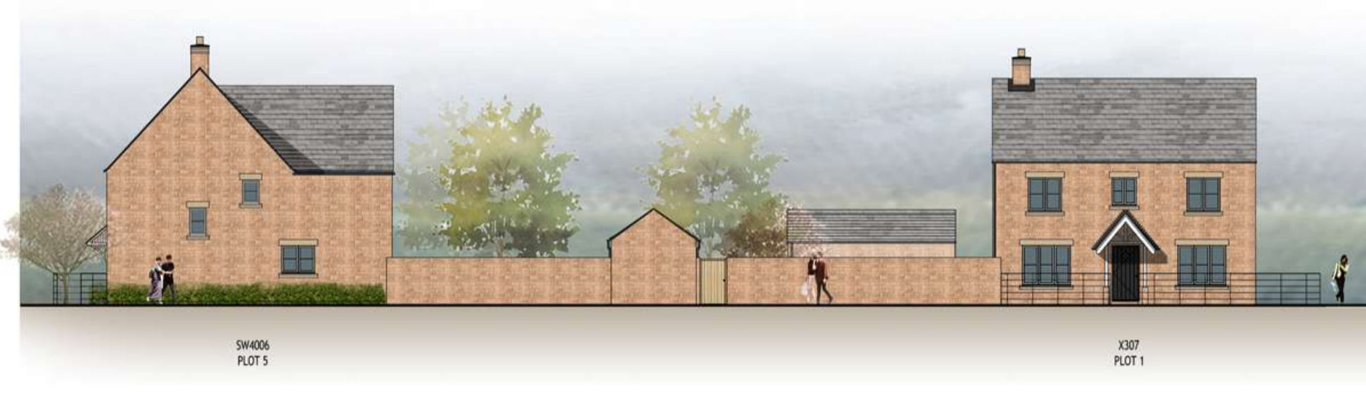
STREET SCENE B-B' Plots 5-1 Scale: 1:200