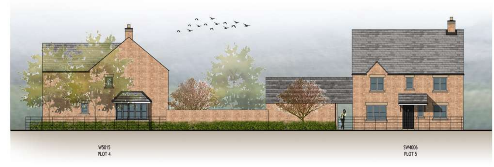
STREET SCENE C-C' Plots 4-5 Scale: 1:200